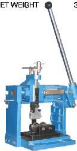
Hand Machine MP - 10