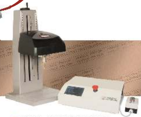
MARKTRONIC MULTIDOT 3000 Single Marking System for all Requirements