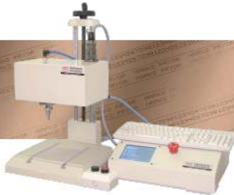
MARKMATE PNEUMATIC Extremely user friendly machine