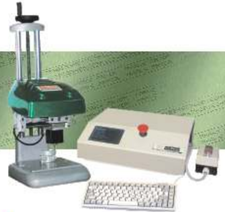
MARKTRONIC MARKMATE Workshop Dot Marking Machine