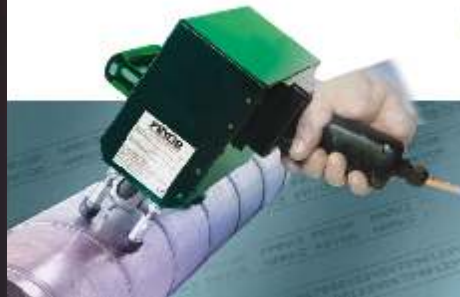
MARKTRONIC P130-30 Portable Handheld Marking System