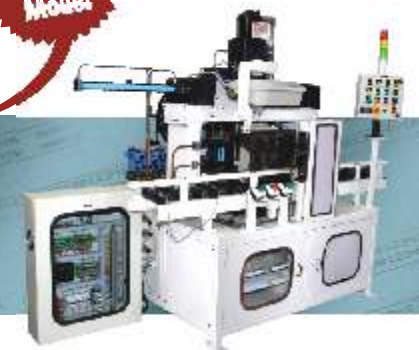
SPECIAL PURPOSE MARKING MACHINE Hydraulically Operated Automatic Cylinder Block & MB Cap Marking Machine