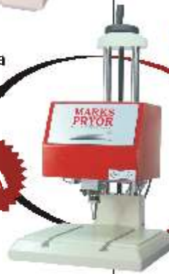
MP - 1000 For Flat as well as Round Parts